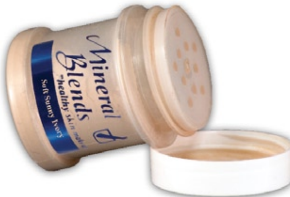
20 gram Plastic Bottle (approx actual size)