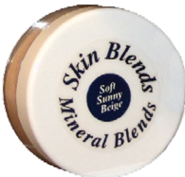
10 gram Jar (approx actual Size)

Our containers are the perfect solution for loose mineral powders ... no mess and easy to use at home and on the go! The container lids or disposable tissues can serve as makeup palettes. Mineral Blends come in three easy to dispense containers with sifters, and each is filled by weight.