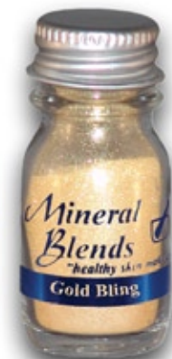
Mini Glass Bottles (approx actual size)

Face - 5 grams Color Modifier - 5 grams Blush - 3 grams Bling / Pearl 3grams Eye - 3 grams